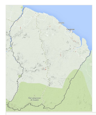
Figure 2. Geographical coverage of the dataset and collecting localities as of 2014.

Description: The sampling area is delimited by the current administrative boundaries of the French Guiana territory (Fig. 2). To the East, the Oyapock River delimits the frontier with Brazil. To the West, the Maroni River delimits the frontier with Surinam. This is an important detail as the delimitation of the territory has not been constant throughout history and a large portion of northern Brazil was disputed between France and Brazil during the 19th century. Several species described or reported from French Guiana during the 19th century and early 20th century (see Kury 2003) are actually located in Brazil. Even though French Guiana is an overseas department and region of France, all occurrences have been recorded under the "French Guiana" country to comply with the ISO 3166-1 standard.